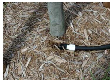
Figure 1. Types of microirrigation emitters: Bubbler.

Agricultural Engineers Standards, EP405.1, St. Joseph, Michigan.