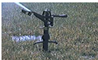
Figure 7. Type of traditional landscape and turf irrigation emission devices: Impact sprinkler.