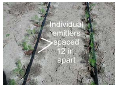
Figure 3. Types of microirrigation emitters: Drip tube or tape.