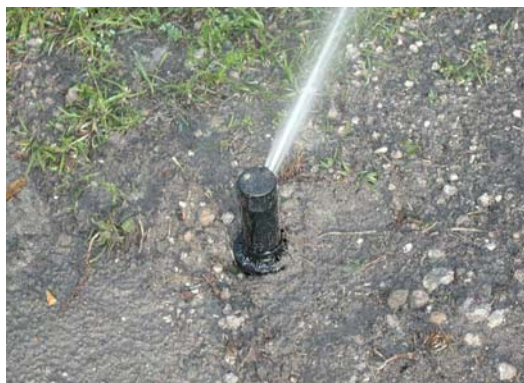
Figure 6. Type of traditional landscape and turf irrigation emission devices: Gear-driven rotor sprinkler.