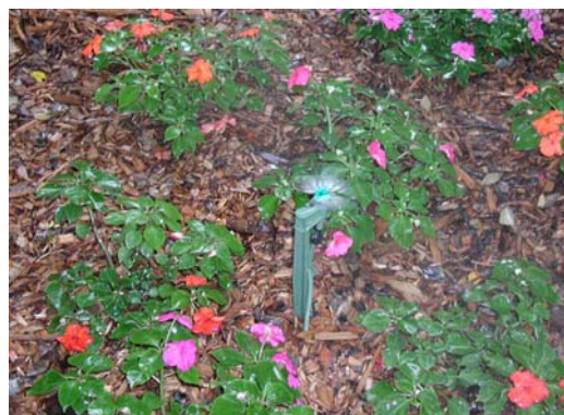
Figure 4. Types of microirrigation emitters: Microspray or microjet.