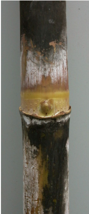
CL 61-620 Bud.