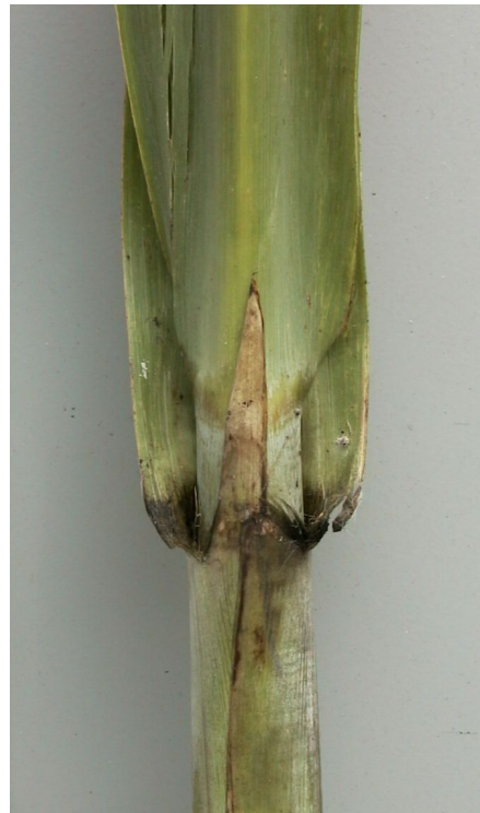
CL 61-620 Auricle.

Descriptive terms that apply to sugarcane cultivar CL 61-620 are presented in Table 1. This cultivar has been a stalwart producer for the industry for many years and is now being phased out.