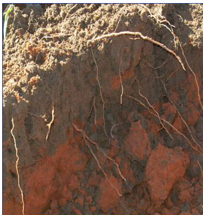
Figure 2. Earthworms and cotton roots in the natural soil compaction layer in bahiagrass-rotated cotton in Florida.