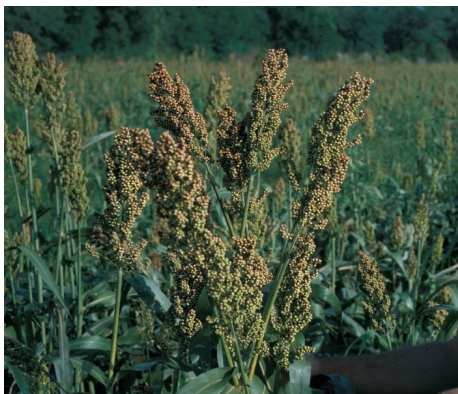
Figure 2. Sweet Sorghum planted in Florida

fermented to ethanol. Alternatively, these varieties can be used as a dedicated bioenergy crop, where both the sugars and the grain are used for ethanol production.