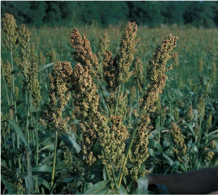
Figure 2. Sweet sorghum planted in Florida