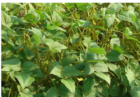
Figure 2. Soybean in vegetative state

also be used for biodiesel. However, the planting and management knowledge is already in place for soybean and it is one of the easiest crops to grow because it makes a good rotation crop with corn or cotton. The procedure for processing these crops into oil is fairly simple and can be done on-farm with small extruders. Oil extracted from soybean can be washed with water and undergoes an esterification process which removes glycerin and allows the oil to perform like traditional diesel. Initially most of this biodiesel may be destined for use in farm equipment, but U.S. automakers are now embarking on putting small diesel engines in passenger vehicles, which will create more demand for diesel as well as biodiesel. Many tractor manufacturers already have warranties on tractors that use blends up to 5-15% biodiesel. Biodiesel provides power similar to conventional diesel fuel, is cleaner burning and has a higher lubricating effect than petroleum diesel.