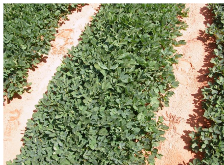
Figure 3. Peanut Production Field

Production costs for peanuts for the edible trade are well known. Yearly updates of production costs can be found at ( http://www.ces.uga.edu/agriculture/agecon/budgetsexcel.htm ). These budgets often show that peanuts cost from $800-1000/A to produce for non-irrigated and irrigated peanuts. If peanuts are to be profitable as a biofuel crop, a lower level of management would be necessary to reduce input costs at current fuel prices.