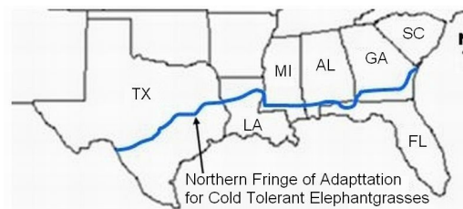
Figure 1. Northern limit of Pennisetum purpureum for sustained production in the southeastern USA

selections, the northern limit for sustained survival and adequate yield is the plant hardiness zone where temperatures do not drop below 15 to 20°F or -6.7 to -9.4°C.