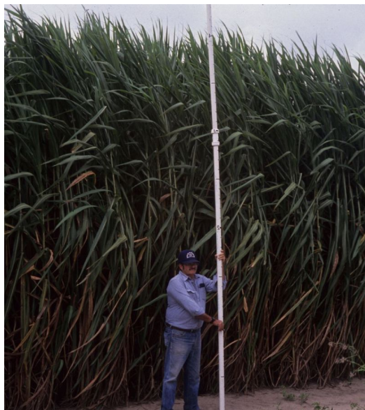
Figure 2. Full season growth of Elephantgrass near Gainesville, FL.

been reduced dramatically. In addition, economic incentives for cellulosic ethanol production exist due to high oil prices and the resulting increase in governmental support programs for renewable energy enterprises.