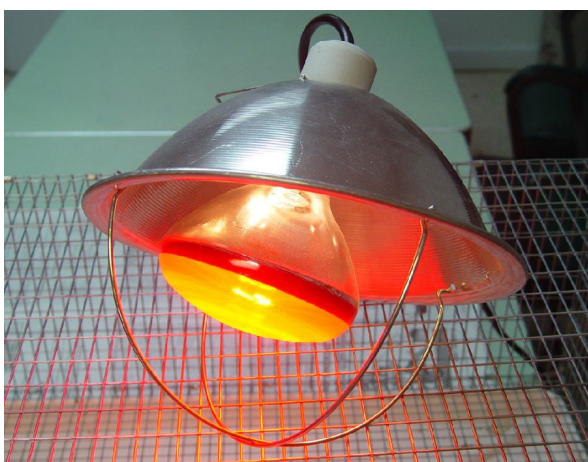
Figure 2. Heat lamp

tolerate temperatures 5 degrees F cooler for each week until they are four weeks old. In other words, one week old chicks can tolerate 90 degrees F and two week old chicks can tolerate 85 degrees F. The easiest way to heat a homemade brooder is with a light bulb or heat lamp (see figure 2). Suspend the heat source over the middle of the brooder. Observe the chick' behavior to get the brooder temperature right: they will huddle up in the middle directly under the heat source if the brooder is too cold and move to the edge of the brooder away from the heat source if it is too hot. When the brooder is at a comfortable temperature, the chicks will move about freely throughout the available space.