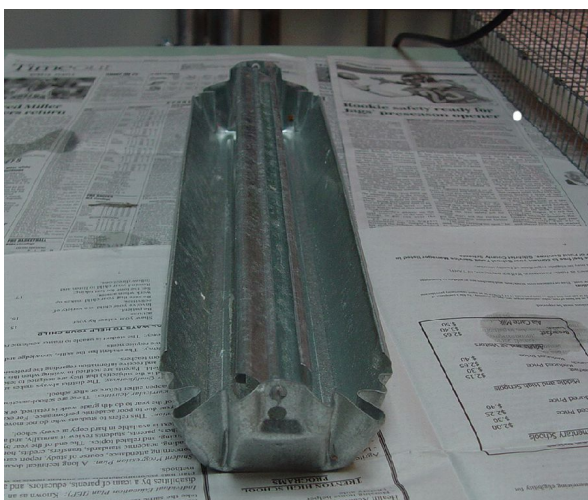
Figure 4. Chick feeder

As previously noted, one can start the first meal on newspaper, and once chicks learn to eat, introduce a feeder (see figure 4). Make sure the feeder is large enough that each chick has a place in the “pecking order”. Chicks should always have a constant supply of feed and water available to them.