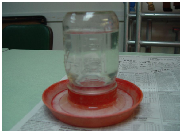
Figure 3. Chick water fountain

Chicks can survive up to two or three days without eating or drinking right after hatching because they are able to utilize the nutrients remaining in their retained yolk sac during this time. This is how hatcheries can ship chicks all over the country with little or no mortality. When chicks arrive, they will be thirsty. It is extremely important to make sure each chick gets a good drink of water upon arrival. Water should be available to chicks at all times. It is optional to add 1/4 to 1/2 cup of sugar to one gallon of water to give chicks upon arrival to boost the chicks energy level if they appear lethargic. Also one teaspoon of antibiotic powder specially labeled for chicks and available at most feed stores can be added to water if the chicks appear unthrifty upon arrival. As chicks are removed from the shipping box, dip their beaks in the water to encourage them to drink (see figure 3).