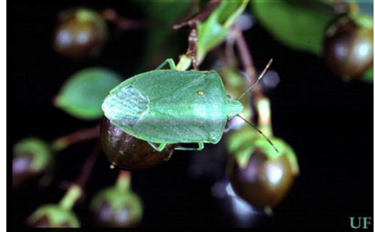
Figure 5. Southern green stink bug, Nezara viridula (Linnaeus), with attached parasite egg.

beggarweed and other legumes, where the eggs are laid in clusters. This insect is most destructive to tangerines. Other species of stink bugs also attack citrus fruit, but are not usually found at high population levels.