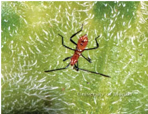
Figure 3. Nymph of the leaffooted bug, Leptoglossus phyllopus (Linnaeus).