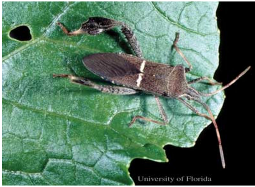
Figure 2. Adult Leaffooted bug, Leptoglossus phyllopus (Linnaeus).