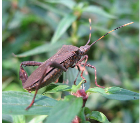
Figure 1. Citron bug, Coreid- Leptoglossus gonagra .

The adult citron bug is dark brown to black in color with the front margin of the thorax yellow. It is approximately 3/4 inch in length and it resembles the leaffooted bug, but does not have the yellow stripe across the wings. This bug tends to gather in colonies and is most active during the warm hours of the day. Populations build up on citron melons and many succulent weeds within the grove or in adjacent watermelon fields. Citron bugs are first found in the grove in late August and early September and, if citron melons are present, the populations may increase to the point where serious citrus fruit losses occur by October or early November.