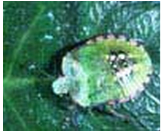
Figure 6. 5th instar, Southern Green Stink Bug, Nezara viridula (Linnaeus).