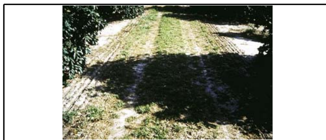
canopy of the tree.

Nematode control following use of postplant nematicides occurs primarily within the zone of application and to a lesser degree, due to the systemic activity of the pesticides, within and around roots outside of the zone of application. Proper placement of nematicides under the tree canopy may significantly improve overall nematode control by targeting applications to areas of highest feeder root and nematode density. However, treatment of roots at the dripline and under the tree canopy may not be possible in many cases because granule applicators are not sufficiently offset to apply and incorporate nematicides beneath the canopy of the tree. Other factors including damage to surface feeder roots, particularly in groves with shallow root systems or during periods of environmental stress, or fruit loss or limb damage in groves with low canopy skirts, must also be considered. On rootstocks which sprout in response to injury, under-canopy incorporation of granules could also severely increase sprout incidence. Therefore, better methods of nematicide delivery need to be developed and evaluated. The future development and registration of effective liquid nematicides that can be incorporated with irrigation could eliminated some of these problems and presumably increase yield response to nematode management in heavily infested groves.