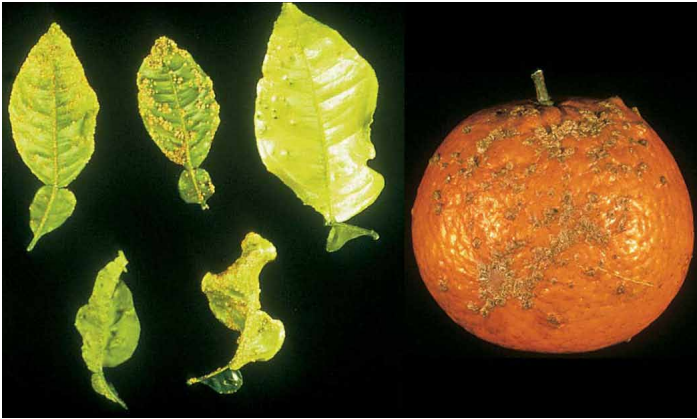
Figure 2. Scab fungus

Since Page has not been widely grown, not a great deal is known about rootstock selection. However, one would likely want to select a rootstock such as Carrizo which could promote fruit size and quality where possible.