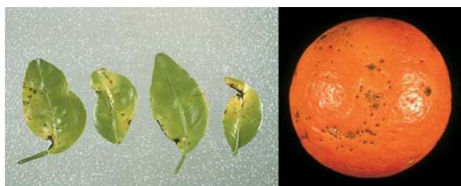
Figure 2. Alternaria fungus disease.

Both the tree and the fruit are susceptible to the Alternaria fungus disease (Figure 2) which can result in defoliation and crop loss unless carefully controlled.