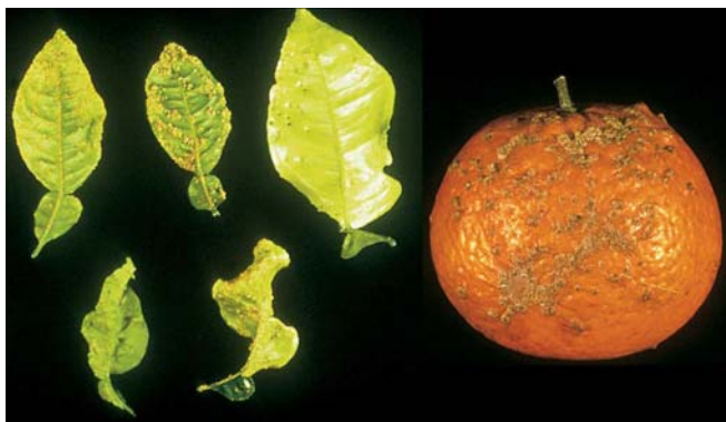
Figure 2. Scab on foliage and fruit.

upward and this may result in sunburn or sunscald to exposed portions of the fruit.