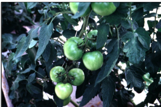
Figure 1. Tomatoes near harvest time.

The primary goal of vegetable harvesting and postharvest handling is to maintain the high quality obtained at harvest through subsequent handling steps (Fig.1). The wise greenhouse operator pays close attention to quality maintenance at each step in this postharvest system. Employees should likewise be trained and encouraged to be "quality conscious." Quality is most often lost due to two causes: mechanical injury from rough handling during harvest, packing, and transport; and inadequate temperature management.