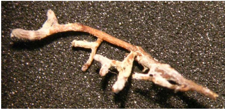
Figure 1. Short, branched ectomycorrhizae of Pinus taeda (loblolly pine) growing in north Florida. The segment shown is 1.5 cm in length.

Arbuscular mycorrhizae, or AM, are the most common type of endomycorrhizae, and known to have originated 460 Million Years Ago (MYA). These fungi are obligate symbionts occurring with most herbaceous and woody plants throughout the temperate deciduous forests, grasslands, and sub-tropical and tropical regions in savannas and rainforests (Leake, 2007). The arbuscule, a highly branched hyphal structure that forms within the cortical root cells, is of central importance in AM because nutrient exchange occurs across the interface between the arbuscule and the cellular contents (Figure 2).