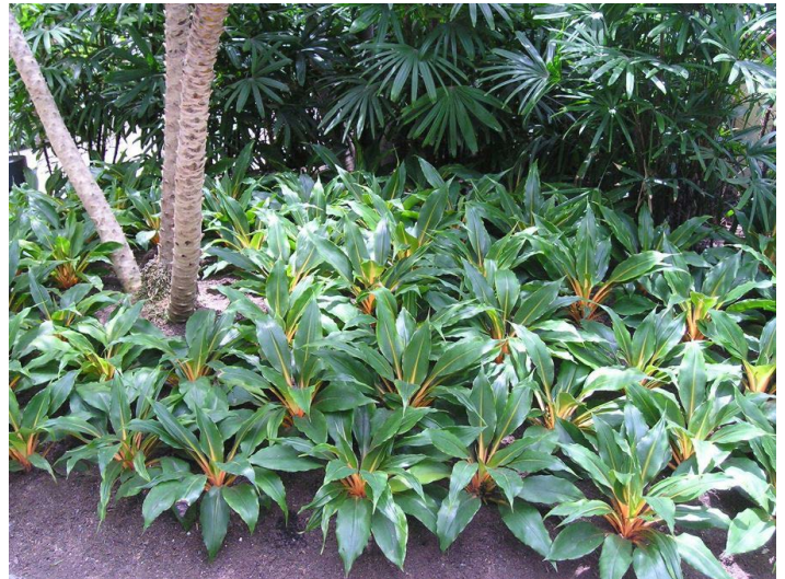
Figure 1. Chlorophytum orchidantheroideis 'Fire Flash' came into the foliage industry through collection from the wild.