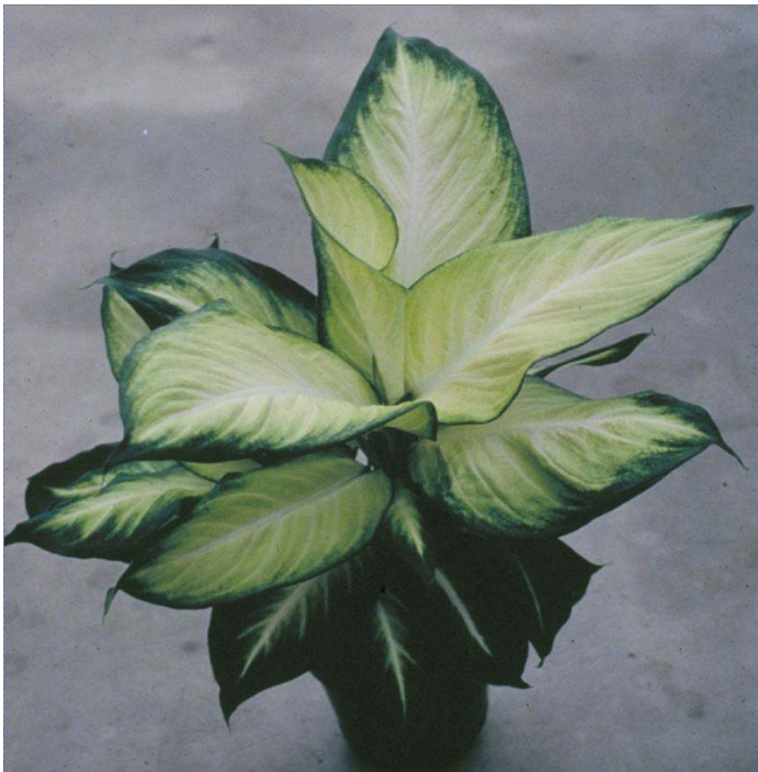
Figure 3. Dieffenbachia 'Triumph', the first hybrid Dieffenbachia released by the University of Florida, was the result of interspecific cross breeding. (Henny et al. 1987)

in the early 1980s. Traditional breeding through hybridization has focused on maximizing heterozygosity. Therefore, interspecific hybridization has become the most common practice in breeding hybrid foliage cultivars (Figure #3). Interspecific hybridization offers opportunities for obtaining gene recombinations and expands the range of genetic variability beyond that of a single species. Additionally, interspecific hybridization creates unique ornamental characteristics that could not be achieved through intra-specific crosses. Parents used in foliage plant hybridization are not usually derived from inbred, single-seed descent, or pedigree selection because inbreeding depression limits development of inbred lines in most foliage plant genera. By intercrossing distinct clones, both of which have desirable characters, populations are created that may be utilized directly for selection of new clones. If the parent clones are heterozygous, each seedling is a potential new cultivar that can be fixed by vegetative propagation.