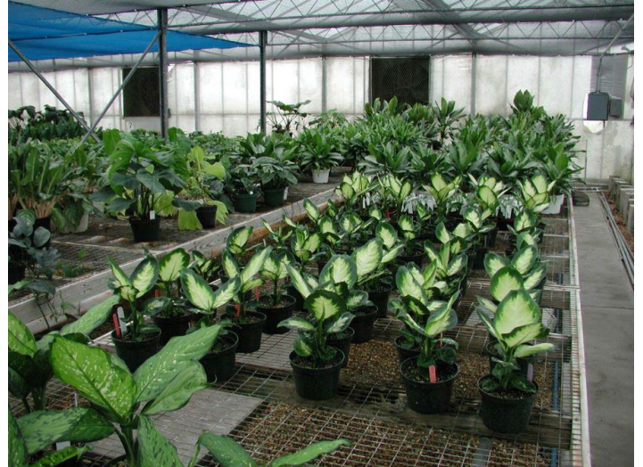
Figure 4. Growth studies, conducted at the Mid-Florida Research and Education Center in Apopka, FL, are a key component in the evaluation process for the new Dieffenbachia cultivar above.

of a new plant prior to commercial release must include thorough taxonomic identification. Methods of propagation and stability in propagation will be information required by examiners if patent protection is sought for a new variety. Cultivation parameters and any special techniques will be needed for grower education, training and marketing. These requirements will help define and assess the ornamental value.