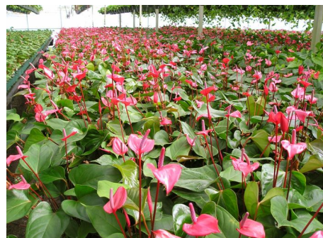
Figure 3. A greenhouse crop of container-grown Anthurium 'Red Hot' in a commercial nursery in Apopka, Florida.

Anthurium X 'Red Hot' reached marketable size in 11 months. Fertilizer level did not significantly affect any of the variables measured. All plants were