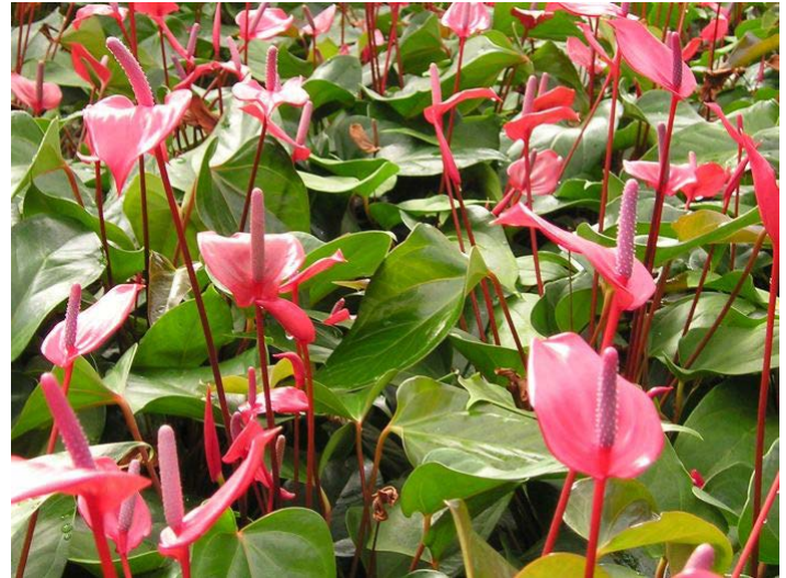
Figure 1. Mature Anthurium 'Red Hot' growing in 6-inch (1.6 L) containers.

Anthurium X 'Red Hot' (Figure 1) is an interspecific hybrid developed by the Foliage Plant Breeding and Genetics Research Program at Mid-Florida Research and Educational Center-Apopka as a flowering potted foliage plant. Anthurium ( Anthurium andreanum Linden ex Andre (family:Araceae) has been traditionally developed and grown for cut flower production because of its showy red, orange, pink or white spathes (Kamemoto and Kuehne, 1996). The large overall size, long petioles and peduncles on the cut flower selections generally preclude their use as container plants. Recently, new Anthurium varieties are being developed to emphasize a smaller overall plant size, a propensity to produce basal shoots and a highly prolific flowering habit. Such hybrids are readily adaptable for flowering pot plant production. Anthurium X 'Red Hot' is one such hybrid with numerous attractive, bright red spathes and a compact, well-branched growth habit.