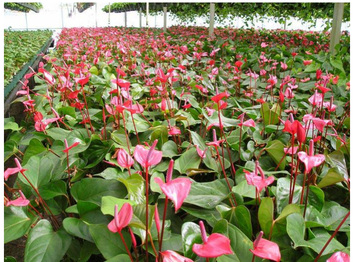
Figure 3. A greenhouse crop of container-grown Anthurium 'Red Hot' in a commercial nursery in Apopka, Florida.

Anthurium X 'Red Hot' reached marketable size in 11 months. Fertilizer level did not significantly affect any of the variables measured. All plants were rated between good and excellent at each fertilizer level as overall plant quality averaged 4.7 out of a possible 5.0. Mature plants were wider than they were tall. Canopy height and width averaged 27.0 cm by 47.5 cm (10.8 by 19 inches) respectively, for the 1.6L (6 inch) pot size. Leaf length 19 cm (7.5 inches) was about twice as long as width 11 cm (4.5 inches). Plants were well branched with an average of 6.2 basal shoots per plant. Both