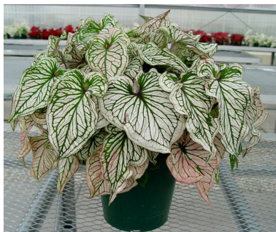
Figure 1. 'UF-331' plant produced by forcing three intact Jumbo (2 1/2 - 3 1/2 inches in diameter) tubers in a 10-inch pot and photographed 10 weeks after planting.

'UF-331' and 'UF-340' are two new lance-leaved caladium varieties with novel combinations of foliar characteristics (Deng et al., 2008). Leaves of 'UF-331' are characterized by large, dark-green veins and white interveinal areas. 'UF-340' develops a large number of wide lance leaves with a large, bright-white center surrounded by green margins.