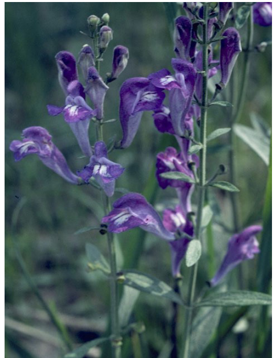
Figure 3. Scutellaria floridana .

Scutellaria integrifolia , or Helmet skullcap, is the most widely observed species found in Florida, as it has been found growing naturally in 54 of the 67 counties. This species is a heavy seed producer, can readily reproduce and spread within landscape, and is commonly observed along roadsides and similarly disturbed, full-sun areas. This species can tolerate both wet and dry soil conditions. Scutellaria arenicola , or scrub skullcap, is the second most common species observed throughout Florida. It can be found in sand and scrub habitats and prefers well-drained soil environments. Nine other Florida native skullcap species can be found throughout the state; however, most have extremely limited ranges and are listed as endangered or threatened, such as S. floridana and S. havanensis .