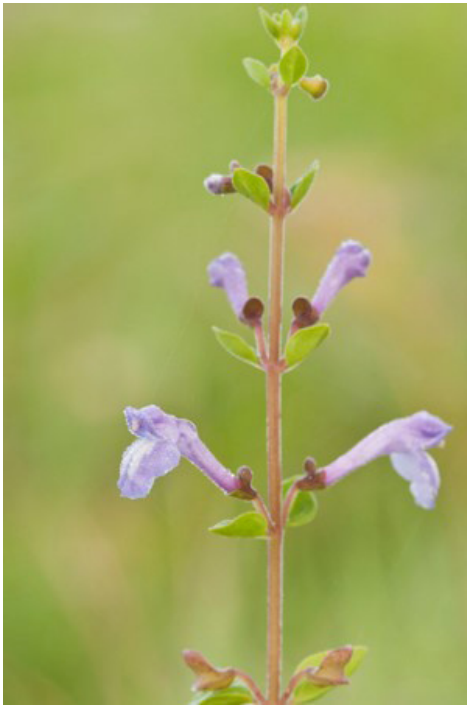
Figure 4. Scutellaria havanensis .

this herb should be further examined for its potential utilization in combination with, or as an alternative to, current cancer therapies (Zhang et al. 2003; Bonham et al. 2005; Scheck et al. 2006). While not recognized formally by the medical community in the US, American skullcap ( Scutellaria lateriflora ) is sold as a constituent in teas and extracts as an herb with anxiolytic effects. It has become a popular alternative to valerian root ( Valeriana officinalis ) and kava kava ( Piper methysticum ) (Awad et al. 2003). At least 35 species of skullcap have been analyzed for medicinal qualities, but S. baicalensis in Asia and S. lateriflora in the US remain at the forefront of commercial propagation (Morgan 2017).