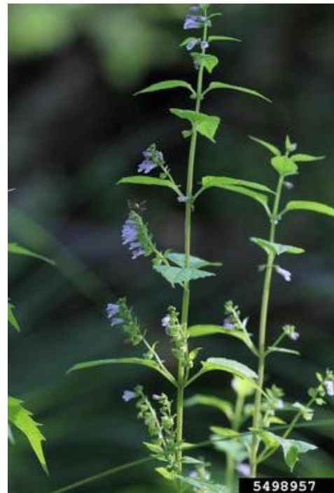
Figure 6. Scutellaria lateriflora , American Skullcap.