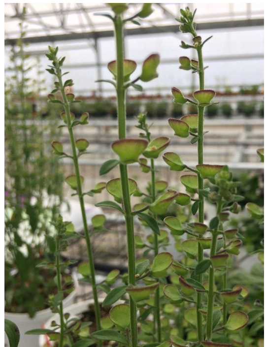
Figure 1. Seed stalks of Scutellaria integrifolia cultivated in a greenhouse in Apopka, FL. Seed stalks of Scutellaria are a distinguishable characteristic. In the field, skullcap plants are often identified by their browning seed stalks which appear spring through fall in Florida.

Scutellaria spp. are cultivated for both their ornamental and medicinal value. Scutellaria baicalensis , or Baikal skullcap, has been utilized for centuries in traditional Chinese medicine to address a variety of health conditions. In the United States, Scutellaria lateriflora , or American skullcap, is a popular herb cultivated and sold as a common ingredient in teas and is believed to have anxiolytic effects when consumed. Many cultivars of this genus are sold as ornamental plants given their aesthetically pleasing flower stalks, long season of blooming, and drought tolerance.