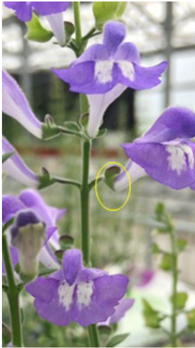
Figure 2. S. arenicola cultivated in a greenhouse in Apopka, FL. The distinct protrusion of the calyx resembling a “cap” over the base of the flower in Scutellaria spp. is where the genus name is derived from.

This EDIS publication is an overview of the genus Scutellaria and its medicinal and ornamental value, with a focus on Florida native species and economically significant species. It includes an overview of botanical characteristics, growth habits, and cultivation protocols of Scutellaria species. This publication is useful to commercial and residential growers and those interested in native and/or medicinal plant species.