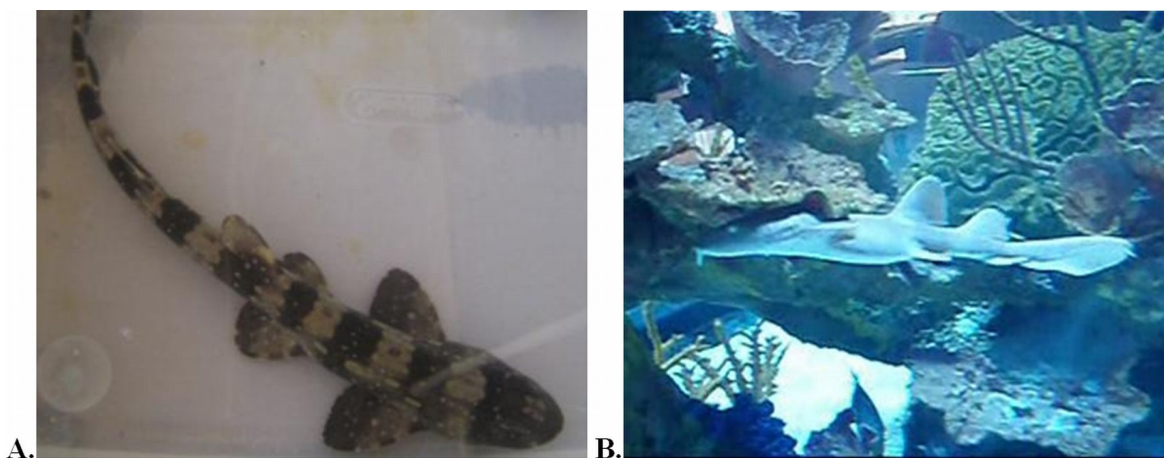
Figure 1. Sharks popular with the home aquarist; (a) white-spotted bamboo shark ( Chiloscyllium plagiosum ), (b) leopard shark ( Triakis semifasciata ).

shark species do not adapt to captive life and maintaining them successfully involves tremendous expertise and financial investment. Another species that is often selected for display is the lemon shark ( Negaprion brevirostris ), due to their typified shark appearance, predatory behavior, ease of transport, and ability to acclimate to tank life. However, due to recent fishing restrictions on the fishery in the USA, lemon sharks may be chosen less frequently for display. This brings up the point that shark species must be selected in compliance with current international, federal and state fisheries regulations, as well as conservation efforts for the species.