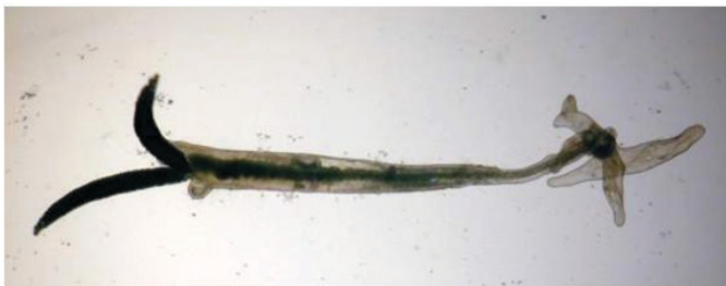
Figure 3. Adult female, removed from fish. Note “anchor” on right, which embeds into the fish, and paired egg sacs on left.

Newly hatched nauplii are free-living (not parasitic) and develop through three different naupliar stages in about 4 days. At that point they molt into the first copepodid stage, become parasitic, and attach to a host, often on the gills. Over the next 7 days, the parasite develops through five different “copepodid” stages. The copepodid stages typically are also found on the gills but are not permanently embedded in the tissue. Once in the final copepodid stage, the male detaches, but the female remains parasitic, attached to the current host or moving to another fish. Adult males die within 24 hours. In one study, the entire life cycle took approximately 18–25 days when fish were held at 29°C.