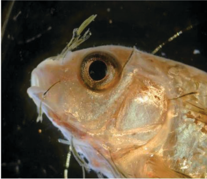
Figure 2. Koi infested with numerous female Lernaea

batches of up to 250 juveniles (nauplii) every two weeks for up to 16 weeks at temperatures warmer than 25°C.