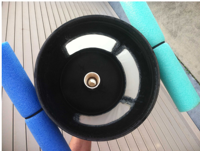
Figure 2. An internal view of the collection bucket portion of a floating airlift collector used at the University of Florida's Tropical Aquaculture Laboratory.