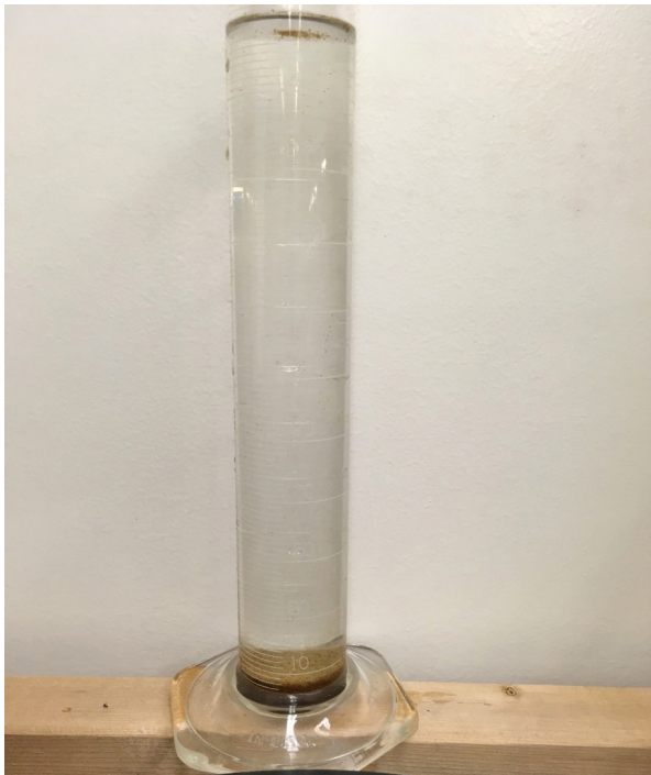
Figure 5. Artemia eggs left undisturbed for a few minutes and allowed to settle to the bottom of a graduated cylinder.

of brined eggs within the large container will facilitate dividing all the brined eggs into the seven smaller aliquots. For example, if there were a 2,100 mL solution of 35 g of brined eggs, it could be split for daily hatching into seven, 300 mL quantities, each containing 5 g of brined eggs. Alternatively, the 2,100 mL solution could be stored in the refrigerator and 300 mL poured off from the container after homogenization to obtain the 5 g of brined eggs as needed. Brined eggs will settle to the bottom when left static in brine solution (Figure 5), so it is important to keep the solution homogenized as the eggs are being split into smaller containers to achieve equal amounts of eggs in each of the containers.