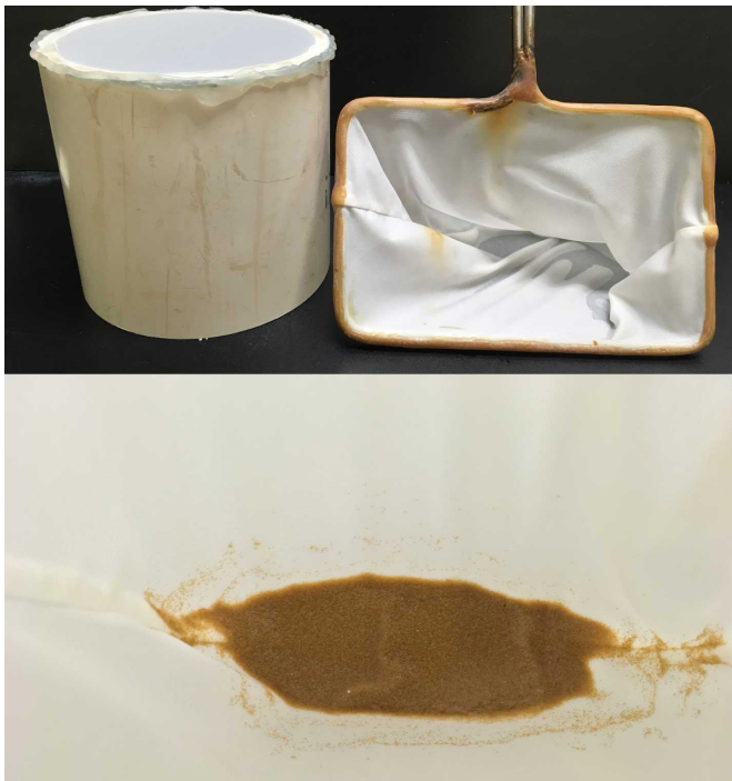
Figure 2. Screened containers and nets (top image) used for harvesting and concentrating Artemia eggs (bottom image).