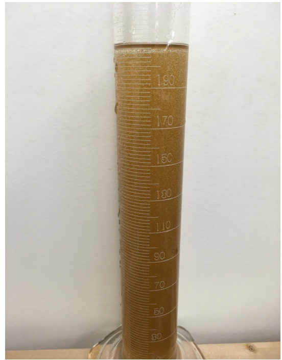
Figure 3. Freshly brined and evenly distributed Artemia eggs within a graduated cylinder used for equal dispersal of eggs into storage containers. In this case, 210 mL of brined eggs could be split into seven equal quantities of 30 mL each.