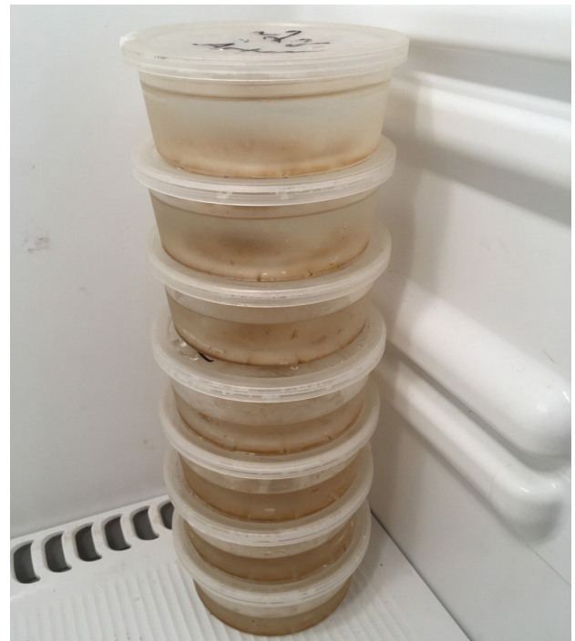
Figure 4. Artemia eggs of equal quantities stored in brine solution within a refrigerator.