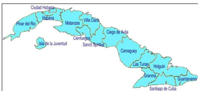
Map 3. Provinces of Cuba.

There have been specific references in the press to extensive losses of banana and plantain trees in many parts of Cuba from the heavy storm winds. Reports indicated the loss of 200,000 banana and plantain trees in Guantánamo province, and 150,000 trees in Laguna Blanca in Granma province, along with 80% of the banana and plantain acreage in Villa Clara province and 70% of Villa Clara's other crops. (Map 3 shows Cuba's provinces.) A separate report indicated the loss of 32,305 hectares of banana/plantain in the eastern provinces, along with 10,000 hectares of other crops, including papaya, yucca, vegetables, beans, maize, and boniato.