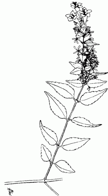
Figure 1. 'Edward Goucher' glossy abelia.