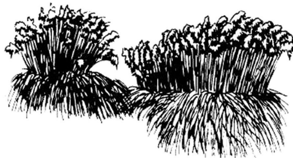
Figure 1. Pampas Grass.

Pampas Grass forms large, impressive clumps, 8 to 10 feet high and wide, with beautiful silver to white feathery plumes arising on female plants in summer and autumn (Fig. 1). This vigorous ornamental grass is widely used as a lawn specimen but its quick growth rate and large size make it unsuitable for most home landscapes. However, it is ideal for barrier or windbreak plantings and has a place in larger areas such as along highways or in commercial or industrial landscapes.