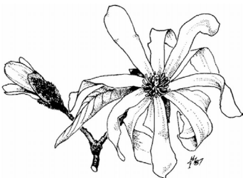
Figure 3. Flower of 'Green Star' star magnolia

Flower color: white; pink Flower characteristic: spring flowering