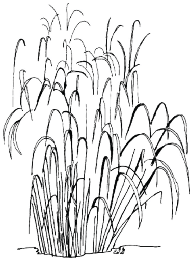
Figure 1. 'Zebrinus' Japanese silver grass

This cultivar has distinctive yellow strips across the foliage, displaying a variegated effect (Fig. 1). Leaves droop and weep toward the ground as do many of the other cultivars. Slender leaves originate in a clump, spreading out and up like a fountain. The 5- to 7-foot-tall clumps bear pink flowers in a one-sided inflorescence in late summer and fall that can be used for drying or as a dye plant. Their pinkish or silvery 8- to 10-inch-long plumes persist into the winter. Foliage is flexible and blows easily in the wind. This shrub-like grass turns to a rich gold in the fall; the fall color lasts through the winter.