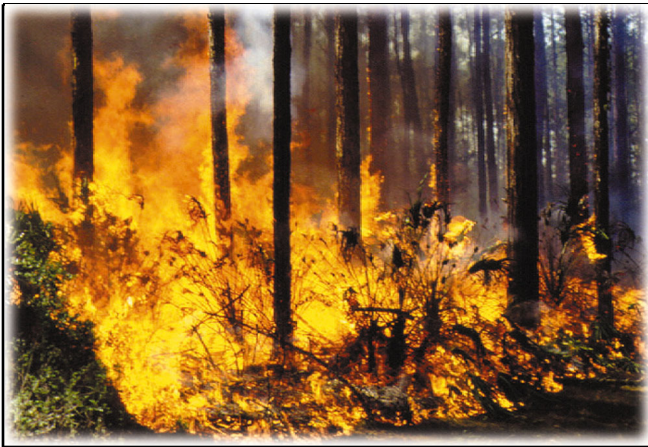
Figure 1. With careful management and preparation, fire can be a positive force in Florida's forests.

Fire is a powerful part of Florida's landscape. It can maintain healthy natural ecosystems, but can also turn a home to ashes. Florida's frequent lightning strikes and human carelessness guarantee that wildfire will continue to be a factor in rural and suburban areas (Figure 1). With the steady rise of new homes in undeveloped areas, some homeowners may wonder if they are in danger of wildfire. Find out if you are at risk, and follow these guidelines to reduce the threat of wildfire.