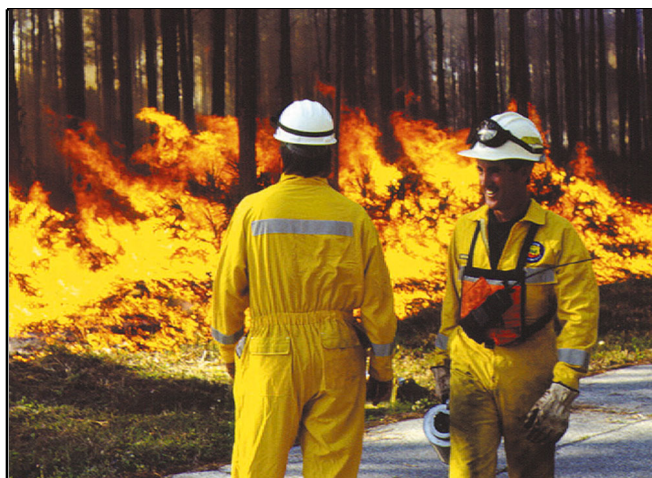
Figure 5. Prescribed fires are managed and controlled.

you can do a variety of other things near your home to increase your protection from wildfire. Just as coastal residents prepare for hurricane season, you should prepare for wildfire seasons (See Figure 5).