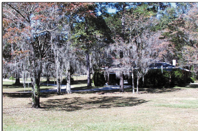
Figure 2. Low risk landscapes are open with grass and trimmed branches.