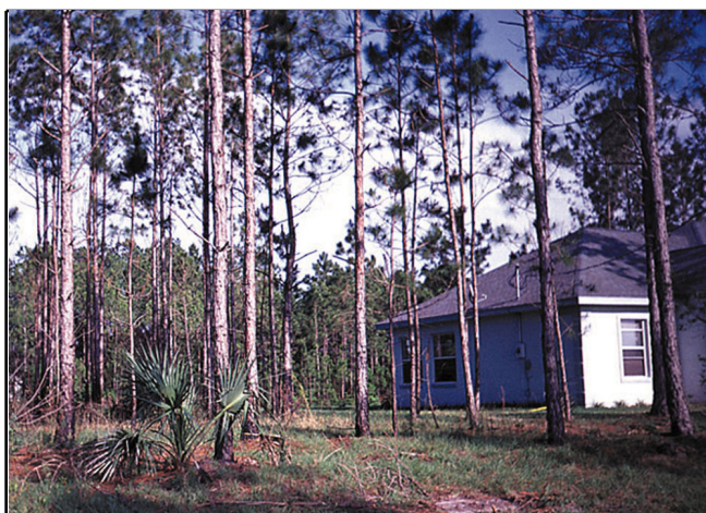
Figure 3. Medium risk landscapes separate ground fuels from tree branches.