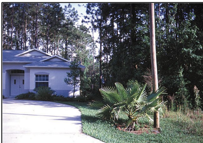
Figure 4. High risk landscapes connect the ground to the canopy with vegetation.