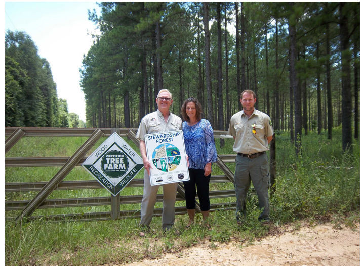
Figure 1. Forest Stewards are landowners who are managing their land according to a written plan for long-term environmental, economic, and social benefits.

The Forest Stewardship Program is based upon the strategy of multiple-use land management. With the help of natural resource professionals, a landowner can develop a management plan designed to increase their forestland's value for any combination objectives including timber production, wildlife habitat, hunting leases, recreation, aesthetics, livestock grazing, and soil and water conservation. Each plan is tailored to meet the landowner's priorities while maintaining the ecological diversity of the forest.