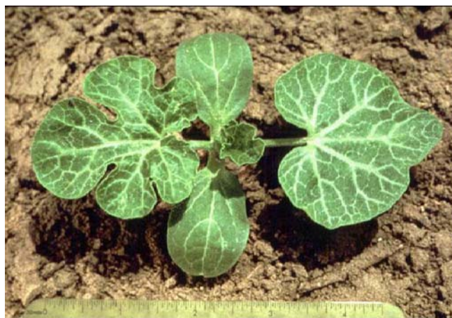
Figure 1. Seedling, Citron melon ( Citrullus lanatus [Thunb.] Mats. & Nakai).

Citron is a monoecious, hairy annual with a climbing or sprawling growth habit (Figure 2). The tendrils are borne to the side of the deeply divided leaves. The three to four pairs of lobes in the leaves