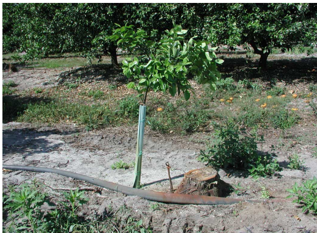
Figure 1. High-headed reset tree

hand harvested until a decision is made to remove the grove and replant with an architecture that maximizes mechanical harvesting efficiency.