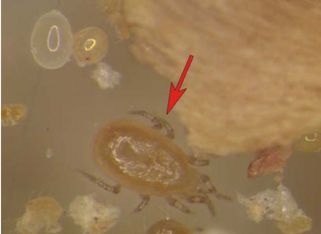
Figure 1. Adult of Neoseiulus californicus (0.1 mm in length X 0.06 mm in width).