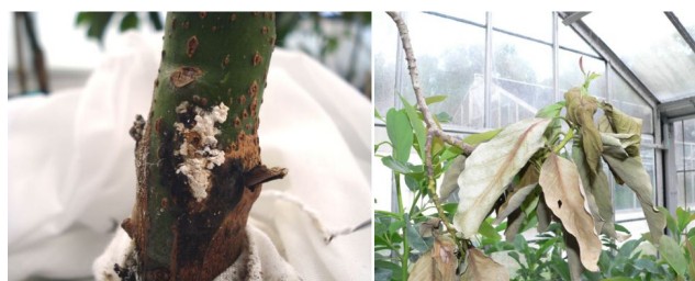
Figure 4. a) A bore-hole from a redbay ambrosia beetle surrounded by dried sap (white-crystal-like) from an avocado stem and b) wilted leaves of laurel-wilt-infected avocado tree.