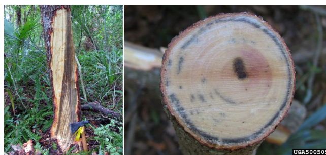
Figure 5. Symptoms of laurel wilt in redbay trees: a) removing the bark reveals dark staining of the sapwood and b) the dark color of the outer ring of sapwood below the bark indicates the tree has been infested by the redbay ambrosia beetle and the wood colonized by the laurel wilt fungus. The fungus that has colonized the sapwood blocks water and nutrient movement in the tree.