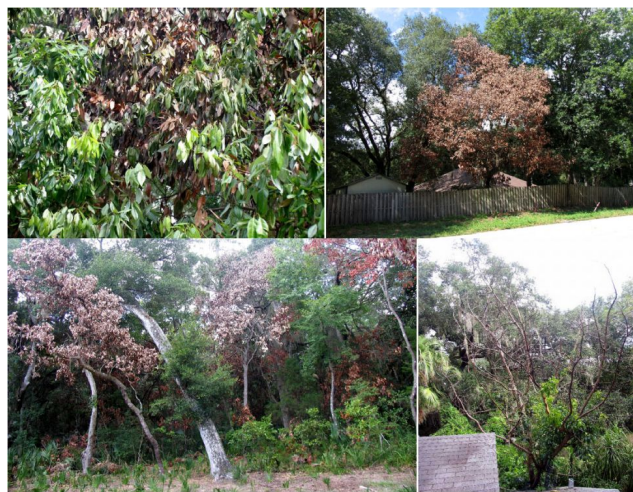
Figure 3. Whole redbay trees killed by laurel wilt.