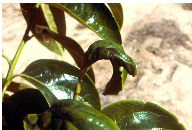
Figure 2. Central rolled leaf shows the damage from the persimmon psylla.

Twig girdlers attack persimmon and a variety of tree species most notably hickory and pecan. During September and October the adult female deposits her eggs by piercing the bark below the buds on terminal twigs. After oviposition the female girdles the stem which may later fall to the ground. In so doing the beetle may transmit the wilt disease Cephalosporium