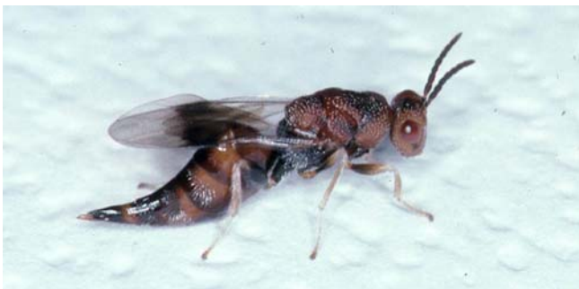
Figure 2. Adult of the annona seed borer.

Bephratelloides spp. develop strictly in Annona seeds. Economic damage occurs when the adults chew their way out of the fruit, creating a 2 mm diam tunnel that provides entry for other insects and decay organisms. Bephratelloides cubensis is thelytokous, reproducing without males. It has approximately 4-5 generations per year. The egg stage lasts 12 to 14 days, the larval stage 6-8 weeks, the pupal stage 12-18 days, and the adult rarely lives beyond 15 days.