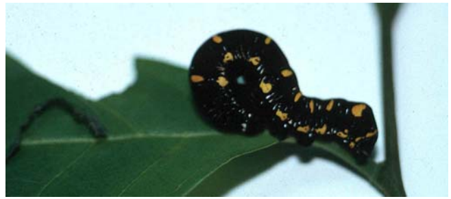
Figure 6. Larva of G. nutrix .

In Florida, larvae of the fruit piercing moths, Gonodonta nutrix and G. unica feed on tender leaves. They do not cause significant damage because they are heavily parasitized by a braconid wasp.