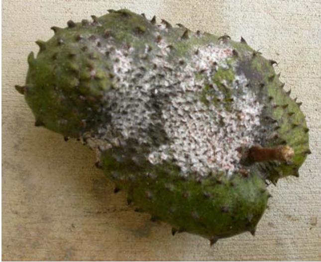
Figure 5. Pink hibiscus mealybug infestation on soursop.

The pink mealybug, hibiscus mealybug Maconellicoccus hirsutus (Green), cause severe damage to soursop. Maconellicoccus hirsutus is an extremely polyphagous species. It affects at least 74 plant families, about 144 genera. Some major hosts include mango, hibiscus, palms, coffee, grape, citrus and Annona spp.