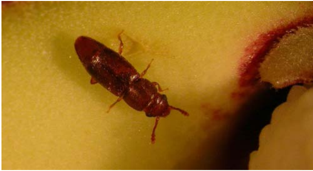
Figure 1. Sap beetle entering an atemoya flower.

are Coccidae (Homoptera), Noctuidae, Oecophoridae (Lepidoptera), and Eurytomidae (Hymenoptera). The most common species in Florida are Bephratelloides cubensis , (Hymenoptera: Eurytomidae), Cocytius antaeus (Lepidoptera: Sphingidae), and the papaya scale Philephedra tuberculosa . Larvae of the moths, Gonodonta nutrix and G. unica feed on leaves, but they are heavily parasitized by braconid wasps.