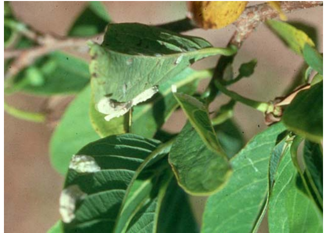
Figure 4. Philephedra tuberculosa infesting atemoya.

In Florida, the scales, Parasaissetia nigra , Saissetia coffeae , S. oleae and Philephedra tuberculosa cause damage by feeding on sap. Sudden increases in populations of these insects coincide with plant stress and absence of effective natural enemies.