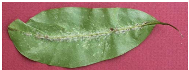
Figure 8. Leaf of soursop infested with Aceria annonae .

Brevipalpus phoenicis affects up to 85% of the epidermal surface of unripe soursop fruit. The fruit becomes bronze colored with darker epidermal cracking and lighter striations, resembling rust. The eriophyid Aceria annonae infests leaves of soursop and pond apple. There are no records of its economic damage or control.