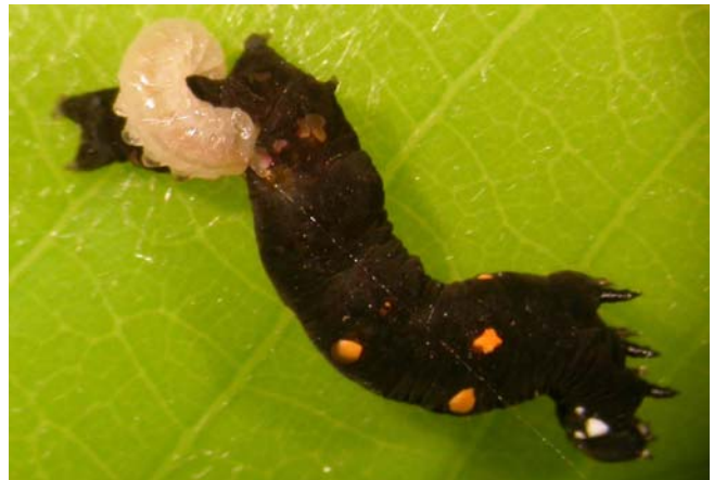
Figure 7. G. nutrix parasitized by a braconid.