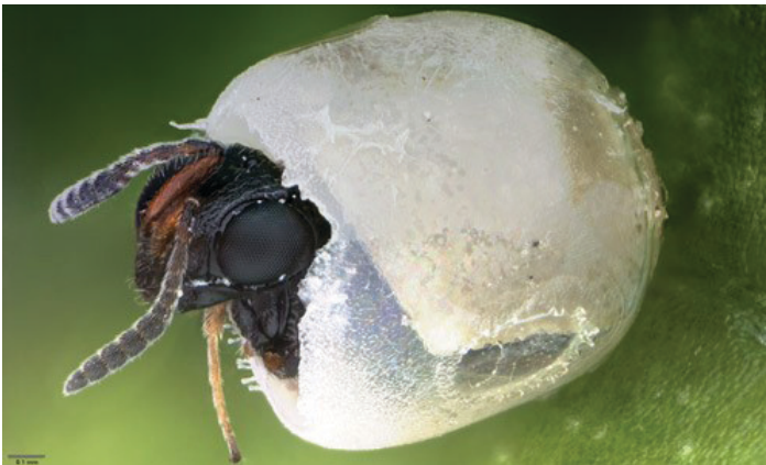
Figure 6. Adult emerging from a brown marmorated stink bug Halyomorpha halys (Stål) egg.