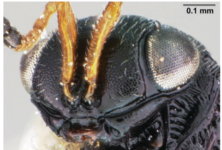
Figure 4. Female Trissolcus japonicus (Ashmead) head.