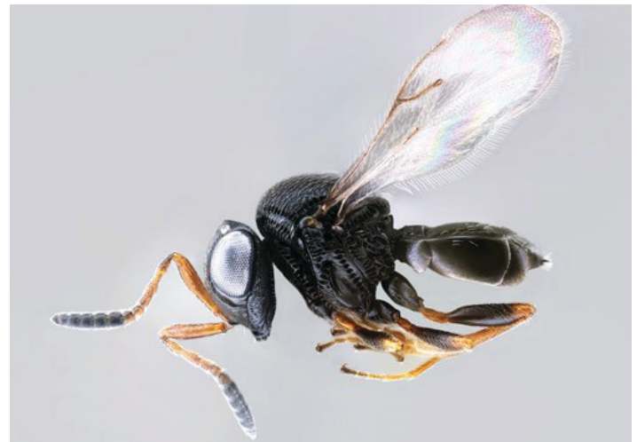
Figure 3. Female Trissolcus japonicus (Ashmead), lateral view.

Click here to view a video of the life cycle of Trissolcus japonicus inside BMSB (video by Chris Hedstrom, published by Entomology Society of America, 2012).