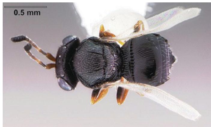
Figure 2. Female Trissolcus japonicus (Ashmead), dorsal view

Trissolcus japonicus adults are small black wasps (1.0-2.0 mm long) (Dieckhoff and Hoelmer 2014). The size of the wasp depends on the size of the host egg from which it emerged (Medal and Smith 2015). The female is slightly larger than the male by 0.1-0.2 mm. The head is large, broader than the thorax, and glossy with a few punctures. The 11-segmented antennae are brown-black, the scape and pedicel yellow-brown. The mandibles are reddish brown. The legs are mostly black with the tibia and tarsi yellow-brown to pale yellow (Hirashima et al. 1981). The wings are transparent with pale yellow veins. The abdomen is broadly oval and longer than the thorax (Ashmead 1904). The ovipositor is barely protruding. For a description that will separate Trissolcus japonicus from other Trissolcus species, review the diagnosis by Talamas et al. (2015a).