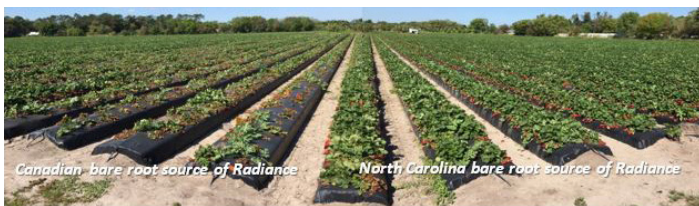
Figure 6. Strawberry field in Plant City, FL, in March 2016 with transplants of 'Florida Radiance' strawberry from different nursery sources. Left: late-season collapse of Canadian transplants infected with northern root-knot nematode; right: same field but with nematode-free transplants from NC.

Understanding the spread, survival, and damage potential of NRKN is the first step in dealing with them. It is also critical to identify means and methods to limit introduction of these nematodes with transplant material. Production of nematode-free nursery plants is the first and most important tactic to manage nematodes. Especially for strawberry, this starts at the source of the transplants, by selecting nursery fields that are free of nematodes and by treating transplants before they are shipped or planted. Hot water treatment can be effective, but is not an option for FL growers because it delays blooming. Also, soil fumigation will not provide protection against nematodes when they are introduced with transplants. Nematode-infected transplants growing in fumigated soil usually suffer more damage than in non-fumigated soil because the NRKN thrives in fumigated soil where there are no competing nematodes, biological antagonists, or natural enemies.