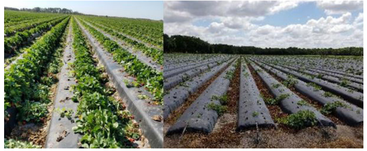
Figure 2. Declining cantaloupe plants that were double-cropped in strawberry beds infested by the northern root-knot nematode ( Meloidogyne hapla ); left: beds with a row of strawberry flanked on the left by a row of stunted and small cantaloupe plantlets. Cantaloupe were replacing a preexisting row of strawberry infected by the nematode; right: stunted and patchy stands of nematode-infected cantaloupe planted as a double-crop in nematode-infested strawberry beds in Plant City, FL, March 2017.

Our field observations indicate that, in addition to strawberry, NRKN can also cause considerable damage to many vegetables that are double-cropped with strawberry in Florida. These vegetables include cantaloupe and watermelon that are grown as a double-crop in strawberry beds (Figure 2). When M. hapla is present in the beds, these double-crops can be severely infected by the nematode, with significant plant mortality and sometimes complete crop loss (Figure 2, right).