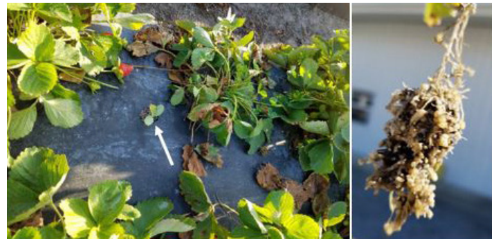
Figure 5. Damage of the northern root-knot nematode ( Meloidogyne hapla ) on cantaloupe. Left: a stunted cantaloupe seedling (indicated by arrow) growing among declining nematode infected strawberry plants; right: a stunted young cantaloupe plant removed from a nematode-infested strawberry bed showing the root system galled and deformed by the nematode in Plant City, FL, in March 2017.

NRKN is one of the most morphologically variable RKNs, with high variability in shape and structural relationships within the species. Two races with different chromosome numbers and reproductive habits have been reported for this species (Karssen et al. 2013). A morphological identification of NRKN must be confirmed by molecular and biochemical analyses. Polymerase chain reaction (PCR) assays and iso-enzymatic analyses to study the patterns of migration of enzymes are conducted at UF, FDACS-DPI, and the GCREC to assist in the rapid differentiation of RKN species. These analyses are conducted by specialized nematologists.