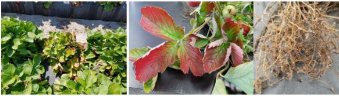
Figure 4. Strawberry damage (shoot and root) due to the parasitism of the northern root-knot nematode ( Meloidogyne hapla ). Left and middle: a plant with reddish and chlorotic leaves among asymptomatic plants; right: a nematode-infected root system showing small, round, and discrete galls from a field in Plant City, FL, in March 2017.

Strawberry plants infected with NRKN may be stunted, with a reddish or yellowish discoloration of the leaves. Aboveground symptoms may look like those of sting nematode damage, and the two can be easily confused. However, root-knot nematode damage on strawberry in Florida typically shows up towards the end of the season (February–March), whereas sting nematode damage normally occurs earlier in the season. Often the presence of NRKN in strawberry is not very evident. Infected plants may appear normal because they become well developed before the winter time, when NRKN becomes more active and infective. If the strawberry root system is well established by the time soil temperatures decrease and become more optimal for the nematode, the plants will be much hardier and more tolerant and may withstand the nematode's parasitism.