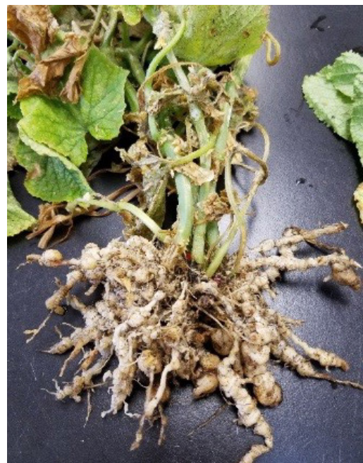
Figure 3. Root galls on cucumber caused by the Javanese root-knot nematode Meloidogyne javanica at GCREC in 2017.

Aboveground symptoms of NRKN include stunted plants, discolored leaves, and overall reduced yield. In general, severe attack by M. hapla will result in badly impaired root function and concomitant stunting of the aboveground parts, reducing yield. Symptomatic plants characteristically occur in scattered clumps because of the patchy distribution of the nematodes. Like all root-knot nematodes, NRKN induces galls or knots in the root system. Unlike such thermophilic RKN species as M. arenaria , M. incognita , and M. javanica , which often cause large, coalesced galls that can cover the entire root system (Figure 3), the galls formed by NRKN are usually smaller and more discrete, as is the case on strawberry (Figure 4).