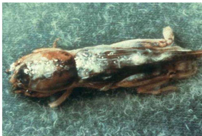
Figure 4. This mole cricket was killed by insecticidal nematodes. The nematodes are leaving the mole cricket in search of other mole crickets to infect.

The University of Florida has issued a license agreement to a company that plans to make these nematodes commercially available by the spring of 2002.