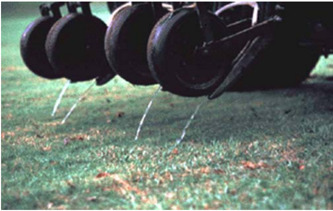
Figure 5. An instrument used for applying nematodes into a field infested with mole crickets.