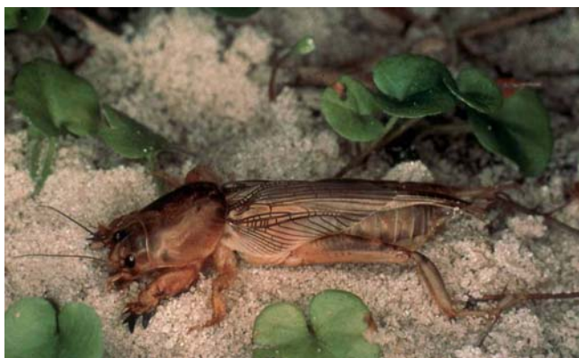
Figure 3. The tawny mole cricket is the most destructive mole cricket to pastures in Florida.