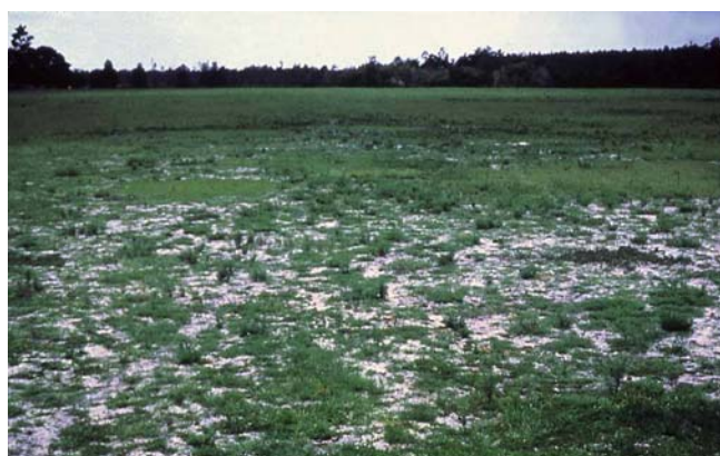
Figure 1. Mole cricket damage to bahiagrass pasture.

may be necessary every 4-5 years. Additional loss in revenue incurred from reductions in forage and hay production as a result of mole cricket damage is about $44.5 million, annually, based on hay production of 4 T/A and a price of $50/T (290 acres x 4 T/A x $50/T x 1200 ranches x 0.64). While chemical control strategies can be effective, they provide only short-term relief and may leave harmful residues in the environment.