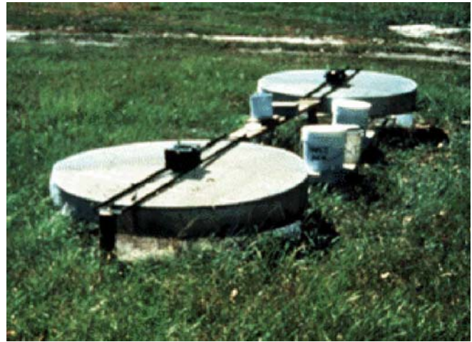
Figure 6. Two mole cricket callers used for collecting mole crickets to monitor the rate of nematode infection after an application of the nematode Steinernama scapterisci into the field.

Neither of these is a preferred method for spreading nematodes, but if the land owner can wait for two or three years for the nematodes to spread, either will work and be less costly. The latter method does not need the sound emitters.