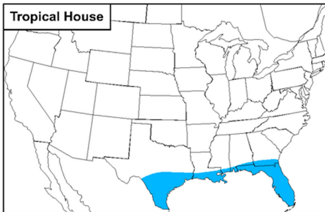
Figure 1. Distribution of the tropical house cricket in the United States.

The tropical house cricket is probably native to southwestern Asia but has been spread by commerce to tropical regions throughout the world.