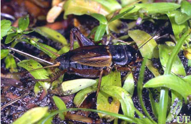
Figure 3. Southeastern field cricket, Gryllus rubens (Scudder), short-winged female.