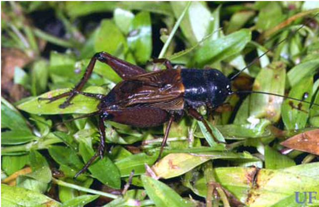
Figure 2. Southeastern field cricket, Gryllus rubens (Scudder), long-winged male.

In western Florida, where both southeastern and southwestern field crickets occur, the only sure means of telling the two apart is by the pulse rate (=wingstroke rate) during the male's calling song. The southeastern field cricket has the slower song, with a pulse rate of less than 62 at 77 degrees F. If the two are singing at the same time and place, a trained ear can identify the males that are trilling at the slower pulse rate as southeastern field crickets