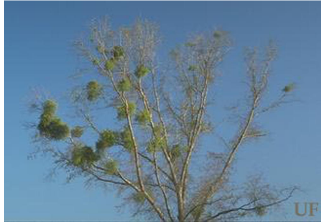
Figure 4. Oak mistletoe, Phoradendron leucarpum (Raf.) Reveal & M.C. Johnst. (=serotinum [Raf.] M.C. Johnst.) in oak tree.

of the tree, under bark, or may wander onto adjacent buildings for pupation. Frequently, pupae are parasitized by parasitoid wasp larvae or by tachinid fly larvae, and adult wasps or flies emerge from the pupal case instead of the butterfly.