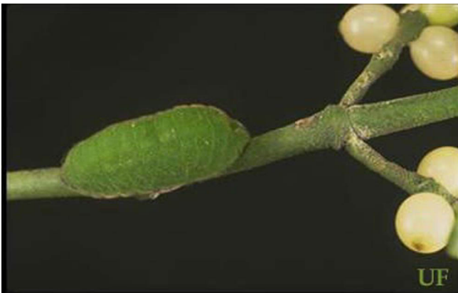
Figure 3. Larva of the great purple hairstreak, Atlides halesus (Cramer), on mistletoe.