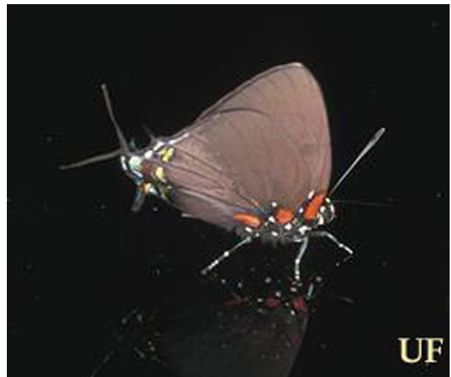
Figure 1. Adult great purple hairstreak, Atlides halesus (Cramer).

spots (one on the front and two on the hind wings). The underside of the abdomen is bright red.