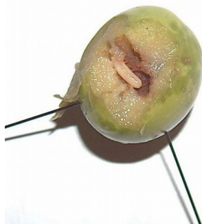
Figure 1. Third instar larva of the olive fruit fly, Bactrocera oleae (Rossi).

Immature stages are similar in appearance to those of other tephritid fruit flies, especially Bactrocera spp. Phillips gives a detailed, illustrated description of the larva.