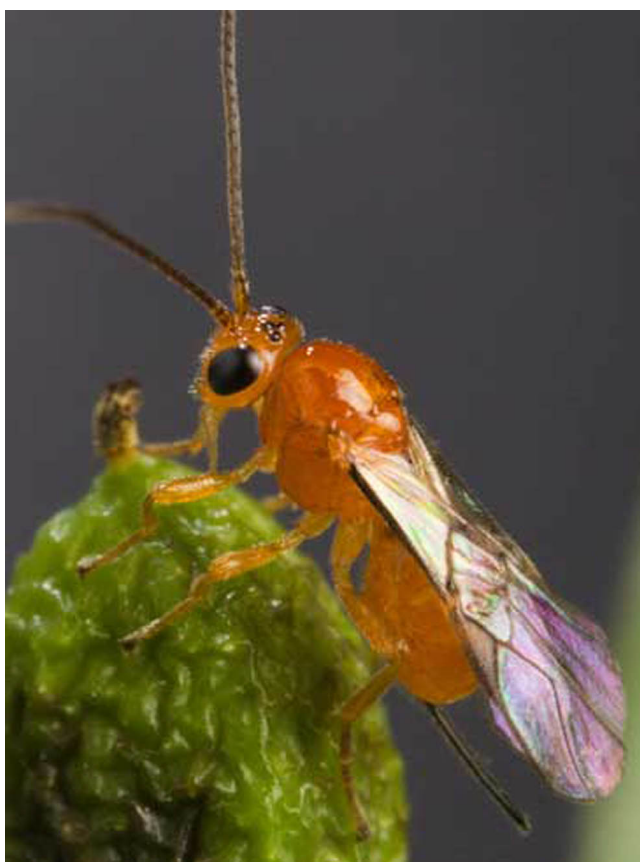
Figure 4. The parasitoid Psytalia cf. concolor was discovered in Kenya, reared in a laboratory in Guatemala, and imported into California for biological control of olive fruit fly.

A recent (2008) introduction of a hymenopteran parasitoid, Psytalia cf. concolor , from Kenya has raised hopes for effective biological control of the olive fruit fly. The wasp appears to be a more effective natural enemy than other olive fly parasitoids brought to California in the early 2000s. Early results showed that the wasp's parasitism rate was variable in some hot, dry, inland groves, where the olive fruit fly is sparse, but in a coastal orchard heavily infested with the flies, parasitism was very high (Wood 2009).