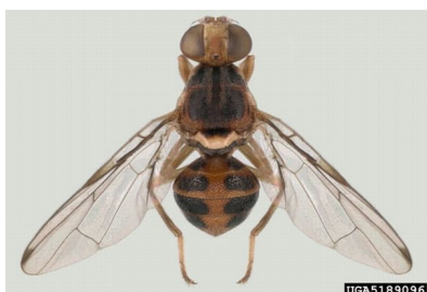
Figure 2. Adult olive fruit fly, Bactrocera oleae (Rossi).