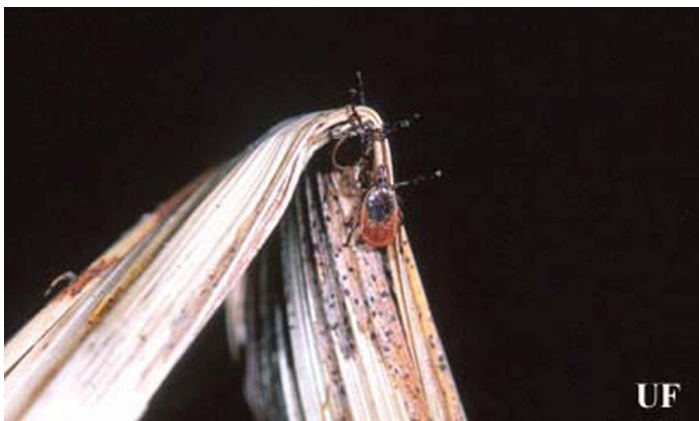
Figure 3. Two male and one female blacklegged tick, Ixodes scapularis Say, questing on vegetation. Only the legs are visible from the second male tick, which is on the opposite side of the vegetation.