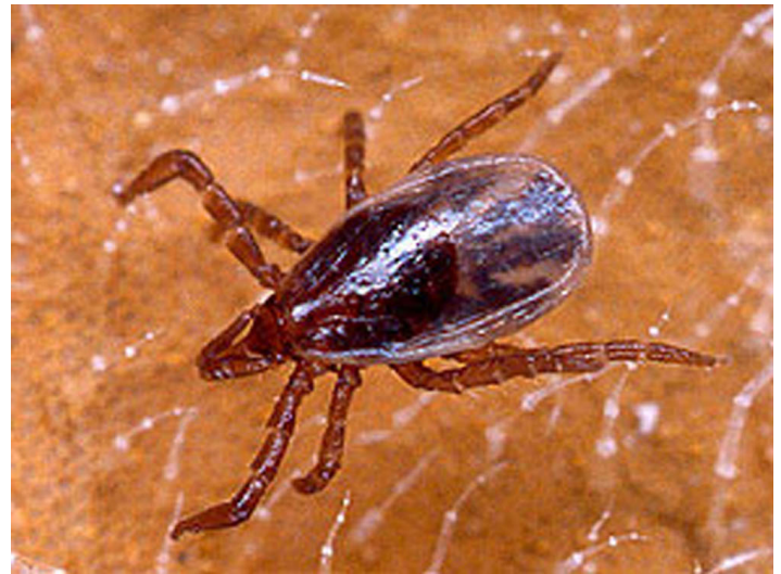
Figure 4. Nymph-stage blacklegged tick, Ixodes scapularis Say.

Ixodes scapularis is a three-host tick; each mobile stage feeds on a different host animal. In June and July, eggs deposited earlier in the spring hatch into tiny six-legged larvae. Peak larval activity occurs in August, when larvae attach and feed on a wide range of mammals and birds, primarily on white-footed mice ( Peromyscus leucopus ) (Anderson and Magnarelli 1980). After feeding for three to five days, engorged larvae drop from the host to the ground where they overwinter. In May, larvae molt into nymphs, which feed on a number of hosts for three to four days. In a similar manner, engorged nymphs detach and drop to the forest floor where they molt into the adult stage, which becomes active in October. Adult ticks remain active through the winter on days when the ground and ambient temperatures are above freezing. Adult female ticks feed for five to seven days while the male tick feeds only sparingly, if at all.