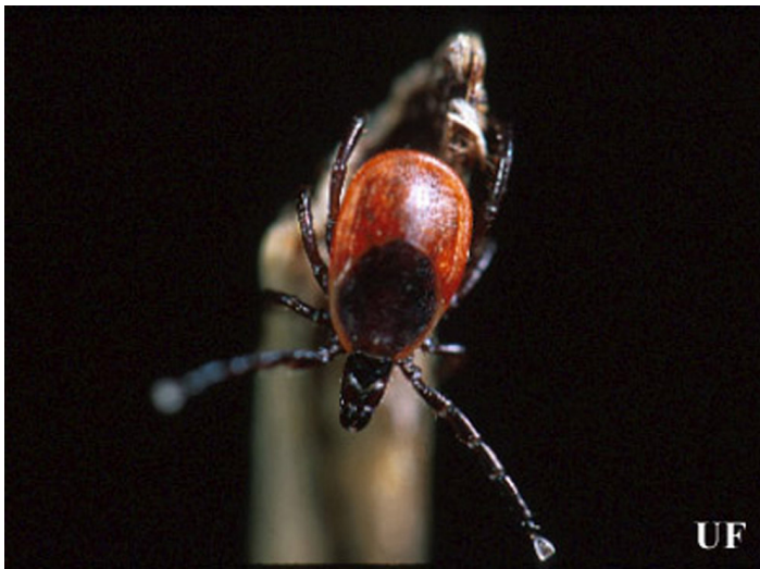
Figure 1. Female blacklegged tick, Ixodes scapularis Say, questing on a stick.