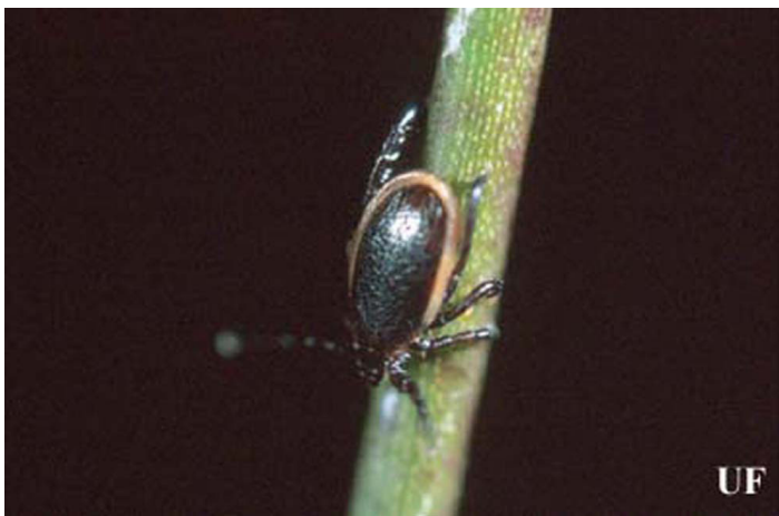
Figure 2. Male blacklegged tick, Ixodes scapularis Say.