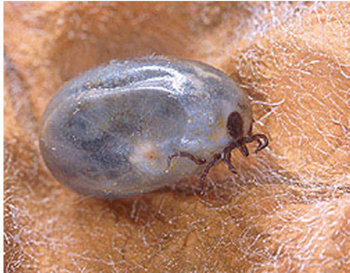
Figure 5. Adult female blacklegged tick, Ixodes scapularis Say, engorged after a blood meal.

(Bertrand and Wilson 1996). Due to their low probability of finding a host, starvation is a major mortality factor of ticks. Host immunity and grooming activity may affect mortality (Randolph 1979, Brown 1988).