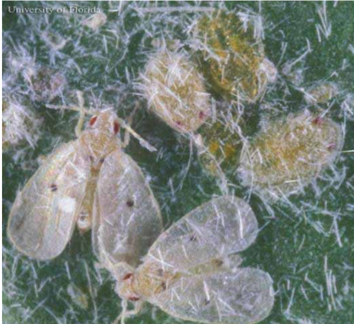
Figure 6. Two pupae of the Cardin's whitefly, Metaleurodicus cardini (Back). The photograph also shows two adults (with wings — in the lower center and left) and two nymphs (more of an orange color), one in the upper right and a second, smaller one, directly below it. The two pupae (one between the adults and the topmost nymph, and the other to the right) are yellowish-white and have red eye-spots.

The pupal cases are just short of 1 mm long and 0.6 mm wide. They are elongate-oval in shape and elevated on a vertical marginal waxen fringe (fig.6). Pupal cases are yellowish-white in color and become semi-transparent when empty. Parasitized pupal cases(fig.7) are blackish throughout or in spots (Back 1912).