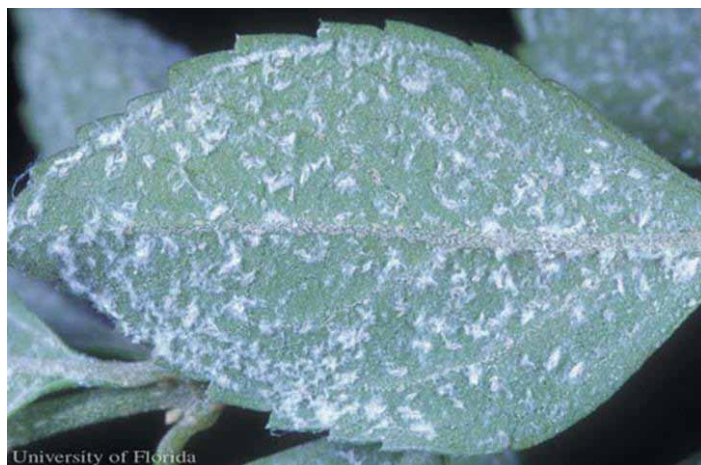
Figure 3. Fluffy wax trails, especially along leaf veins, deposited by adult females of the Cardin's whitefly, Metaleurodicus cardini (Back).

This species is similar to M. arcanus sp. nov.. Metaleurodicus cardini can be separated from M. arcanus since M. cardini possesses four abdominal compound pore pairs compared to five in M. arcanus , and M. cardini has a submarginal row of eight shaped pores that M. arcanus sp. nov. lacks (USDA 2006).