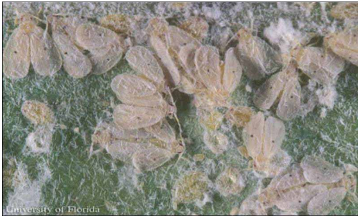
Figure 1. An infestation of Cardin's whitefly, Metaleurodicus cardini (Back).