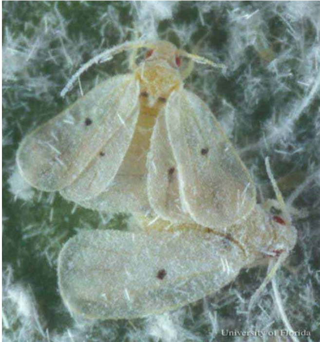
Figure 2. Adult Cardin's whiteflies, Metaleurodicus cardini (Back).

The adults are greenish yellow with a fine dusting of white wax. Their wings are somewhat dusky with a conspicuous dark spot near the center of each wing (fig.2). As females deposit eggs, a fine trail of fluffy white wax is rubbed from a tuft of wax on the underside of the female abdomen (fig.3).