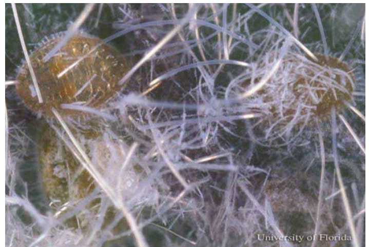
Figure 5. Nymphs of the Cardin's whitefly, Metaleurodicus cardini (Back).