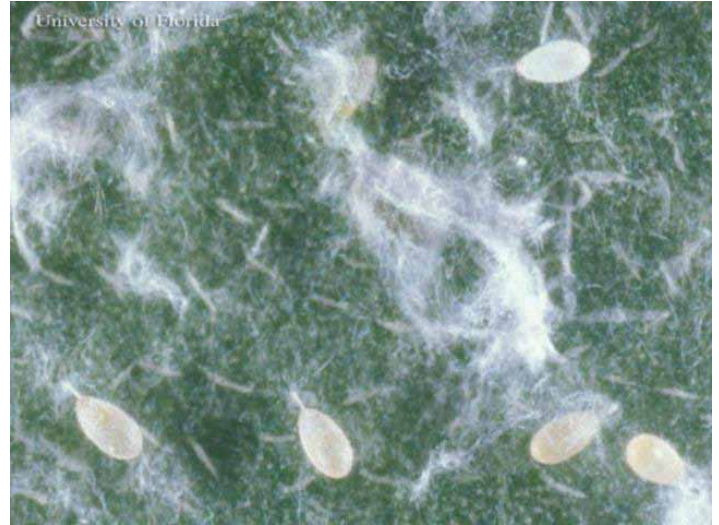
Figure 4. Eggs of the Cardin's whitefly, Metaleurodicus cardini (Back).