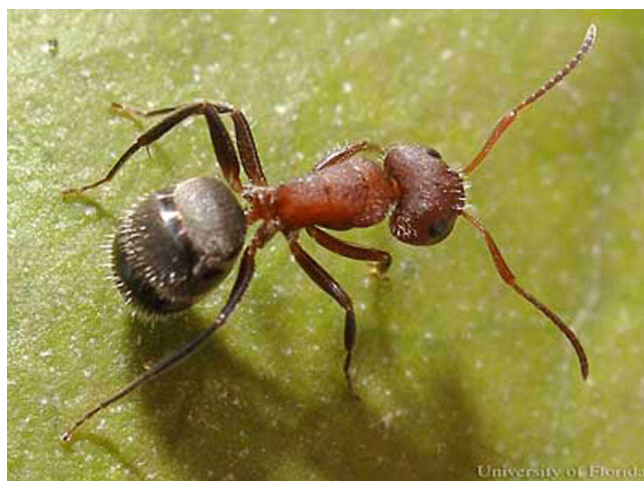
Figure 3. Worker of Camponotus planatus (Roger), the compact carpenter ant (proposed common name).

As with all members of the Order Hymenoptera, the compact carpenter ant develops by complete metamorphosis, going through egg, larva, and pupa in silk cocoons and adult stages. Typically, a single queen will start a new colony, caring for her first larvae until they develop into workers, which then begin to forage for food. Workers then care for the queen and new eggs and larvae. The colony will continue to grow and will usually send out new winged reproductives, or alates, when the colony is two to five years old, depending on environmental