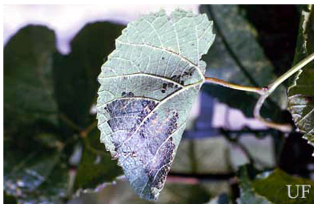
Figure 3. Damage to bunch grape foliage caused by the grape leafroller, Desmia funeralis (Hübner).

Wild and cultivated grapes, Vitis spp., are the principal hosts of the grape leafroller. Two varieties of redbud, Cercis canadensis and C. chinensis ; Virginia creeper, Parthenocissus quinquefolia ; and Oenothera have been reported as occasional hosts.