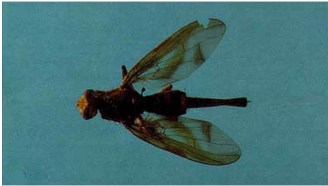
Figure 1. Adult female South American cucurbit fruit fly, Anastrepha grandis (Macquart).

vein R_{4+5} ; distal arm of V band absent, the proximal arm not joining S band.