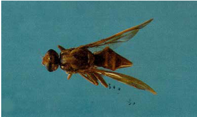
Figure 2. Adult male South American cucurbit fruit fly, Anastrepha grandis (Macquart).

Female terminalia: Ovipositor sheath 5.8 to 6.2 mm long, tapering posteriorly to apical third, which is distinctly depressed and broadened; in profile the sheath is distinctly concave dorsally on median half and concave ventrally on apical third. Rasper well developed, of slender, curved hooks in five or six rows. Ovipositor slightly longer than length of ovipositor sheath, being somewhat curved dorsoventrally to permit fitting into sheath; tip long and slender, without serrations; extreme base slightly widened (Stone 1942).