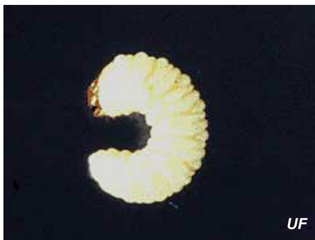
Figure 2. Larva of the hunting billbug, Sphenophorus venatus vestitus Chittenden.