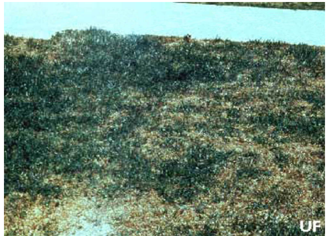
Figure 5. Damage caused by larvae of the hunting billbug, Sphenophorus venatus vestitus Chittenden.

grass can be rolled back like a carpet. Moles, skunks, and armadillos feed on the grubs and may damage the lawn searching for them.