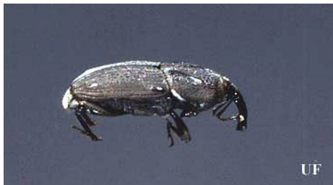
Figure 1. Adult hunting billbug, Sphenophorus venatus vestitus Chittenden.

The hunting billbug, Sphenophorus venatus vestitus Chittenden, is a weevil that is also commonly known as the "zoysia billbug" in Florida, where it has been reported as a pest of various grasses, especially in nurseries. Billbug larva are often confused with white grubs, which is the name usually given to beetle larvae in the genus Phyllophaga , family Scarabaeidae.