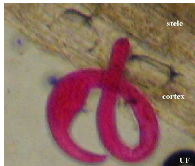
Figure 1. Young female of reniform nematode, Rotylenchulus reniformis Linford & Oliveira, with swollen body. The female penetrates the root of cowpea and the anterior portion (head region) of the body remains embedded in the root whereas the posterior portion (tail region) protrudes from the root surface.

Rotylenchulus reniformis is largely distributed in tropical, subtropical and in warm temperate zones in South America, North America, the Caribbean Basin, Africa, southern Europe, the Middle East, Asia,